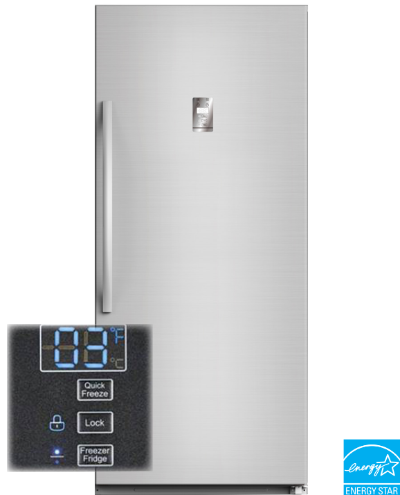
WHS-507FWESS1 Shown in Stainless Steel

Utilize Midea's upright convertible freezer to stockpile your most frequently used frozen foods. Its 13.8-cu. ft. capacity will hold approximately 483 pounds of groceries, allowing you to take advantage of sales on high-priced butcher's favorites. The slide-out bulk storage basket helps keep small foods organized, while the adjustable shelves can be utilized for larger items. The electronic temperature controls allows for precise selection so you can set your freezer at the correct temperature for your needs. This high efficient, Energy Star rated unit can be a quality addition to your household.